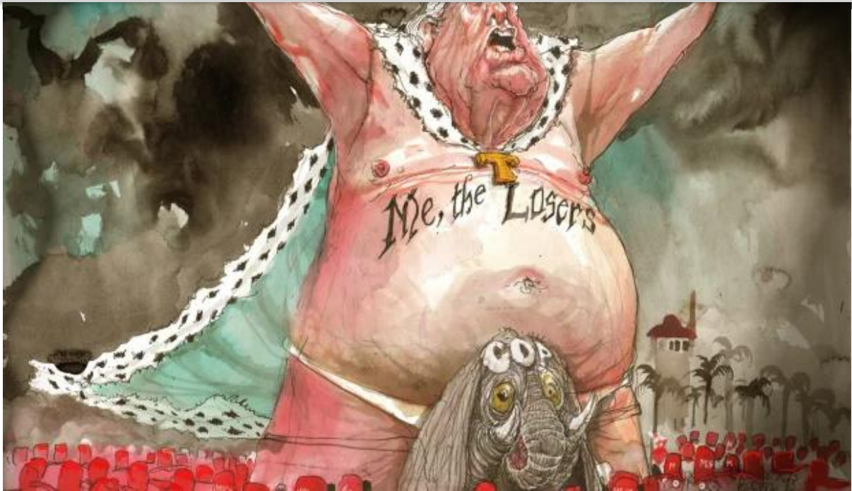
The spectre of Trump looms large.

Nobody has outlined the danger more compellingly than Robert Kagan.