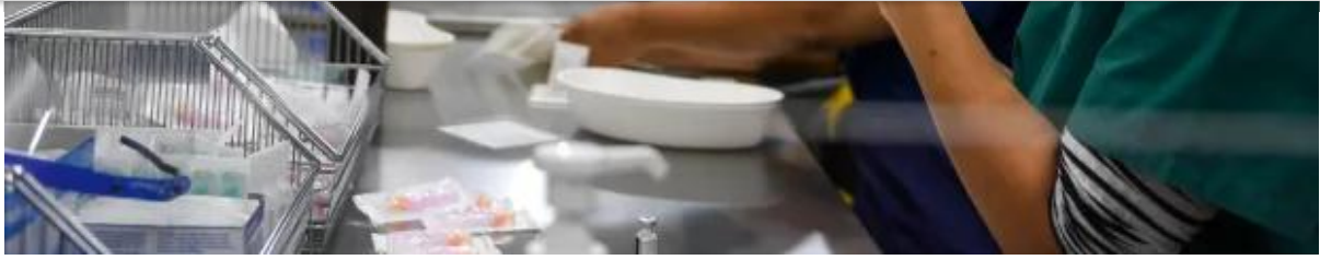
Pfizer vaccine doses being prepared at the Western Health Sunshine Hospital COVID-19 vaccination hub in Melbourne.

Prime Minister Scott Morrison said the additional doses would be available by the final quarter of 2021, bringing total vaccine orders to about 171 million doses. Under the new agreement, delivery of Pfizer stocks would expand in April, and again in May and July.